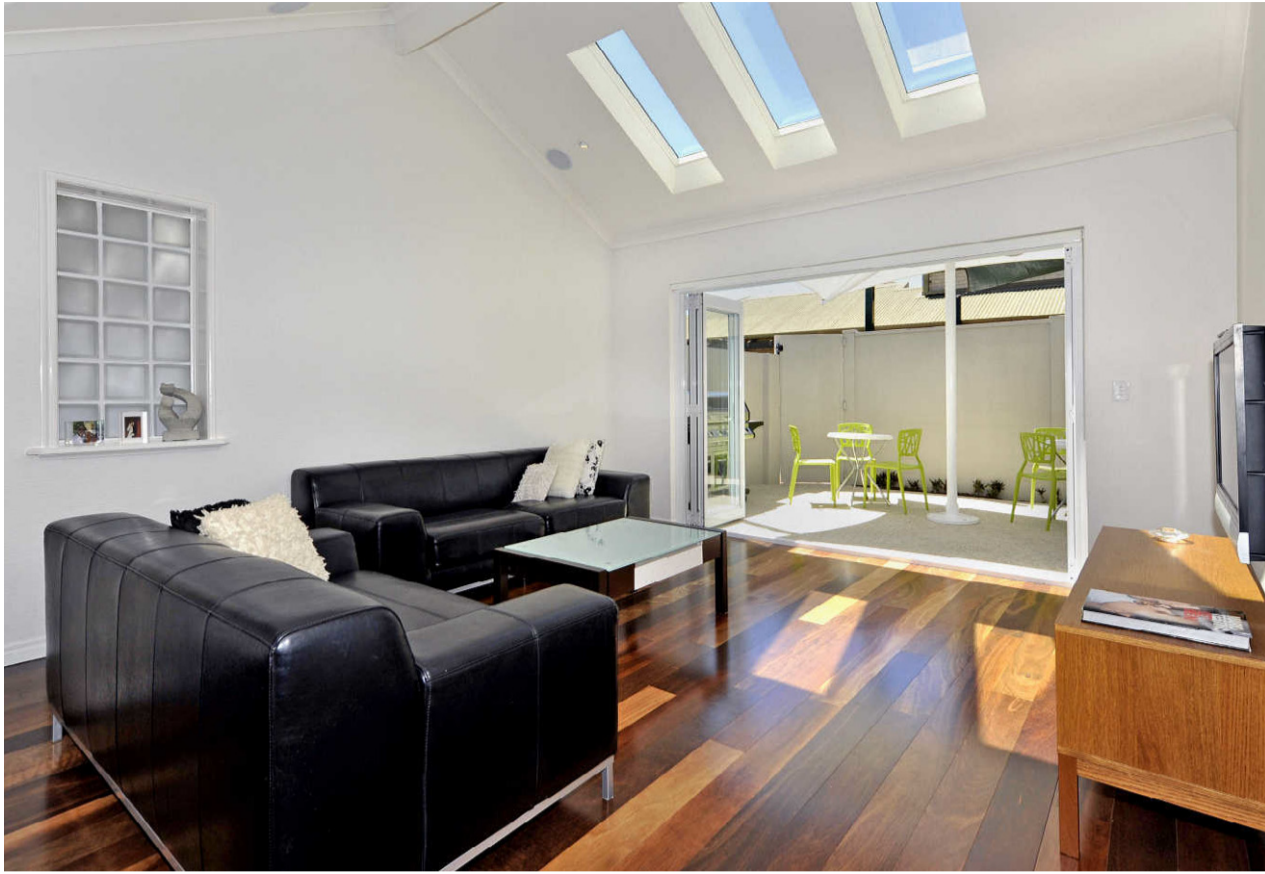
Aluminium bi-fold doors were installed to access the courtyard and provide light to the ground floor.